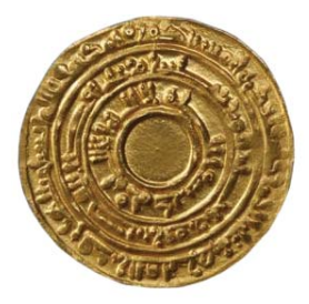
"An example of a Fatimid coin from the time of Mawlānā Imam al-Mu<sup>e</sup>izz"

Nafs-i Rasūl: means 'Soul of the Prophet', which is referred to in the \bar{a}yat -i Mub \bar{a}halah , S \bar{u}rah 3, verse 61 (see Chapter One). This title also reminds us of the number of ah\bar{a}di\bar{s} , in which the Prophet declared the special bond between himself and \bar{H}azrat <sup>c</sup>Al \bar{i} .